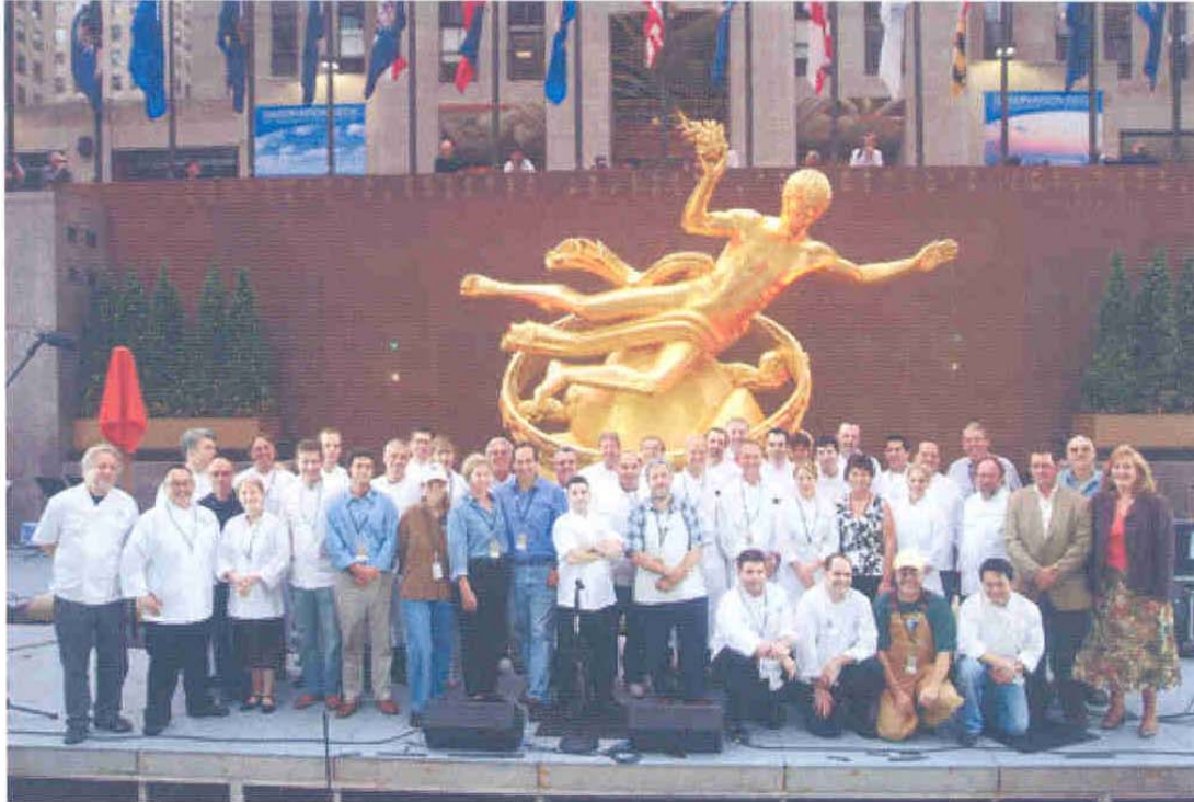
Chefs and farmers at Chefs Gone Wild!