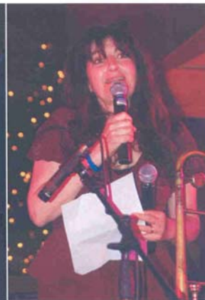
Ruth Reichl announcing participating farmers at Chefs Gone Wild!