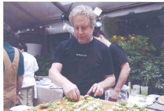
Chef Jonathan Waxman of Barbuto in NYC.