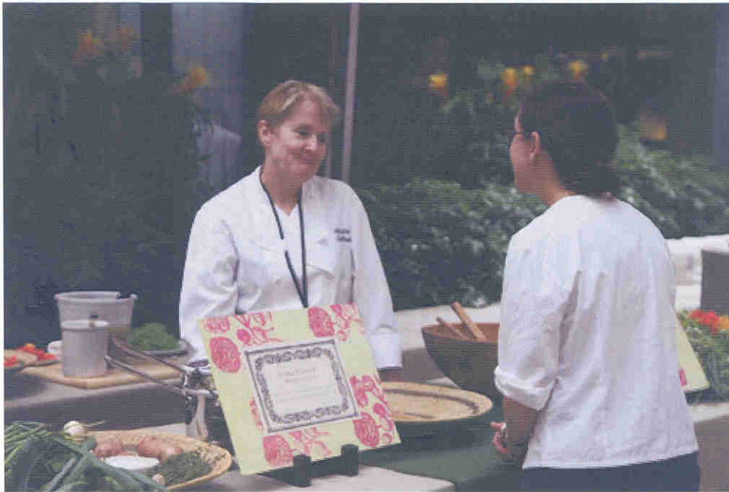
Chef Alice Waters of Chez Panisse in Berkeley, CA and guest.